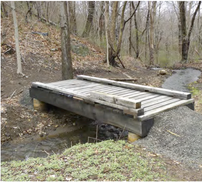
A walkway was recently installed by local Boy Scouts to facilitate the crossing of hikers and to protect the stream banks from eroding (Balcom)

go beyond basic property monitoring and upkeep to the next level by developing habitat management plans for some or all of their properties. Typically, land trusts assign volunteer stewards to individual or groups of parcels; the Branford Land Trust has one to three individuals assigned to about 40 percent of their properties. Each steward is responsible for walking the property several times a year to make sure that no unauthorized use of the property occurs and that no safety hazards or encroachment problems exist. Stewards also maintain trails, assess how the property is being used, and conduct biological/ecological monitoring to assure that the property is being kept in its natural state and no environmental degradation is occurring.